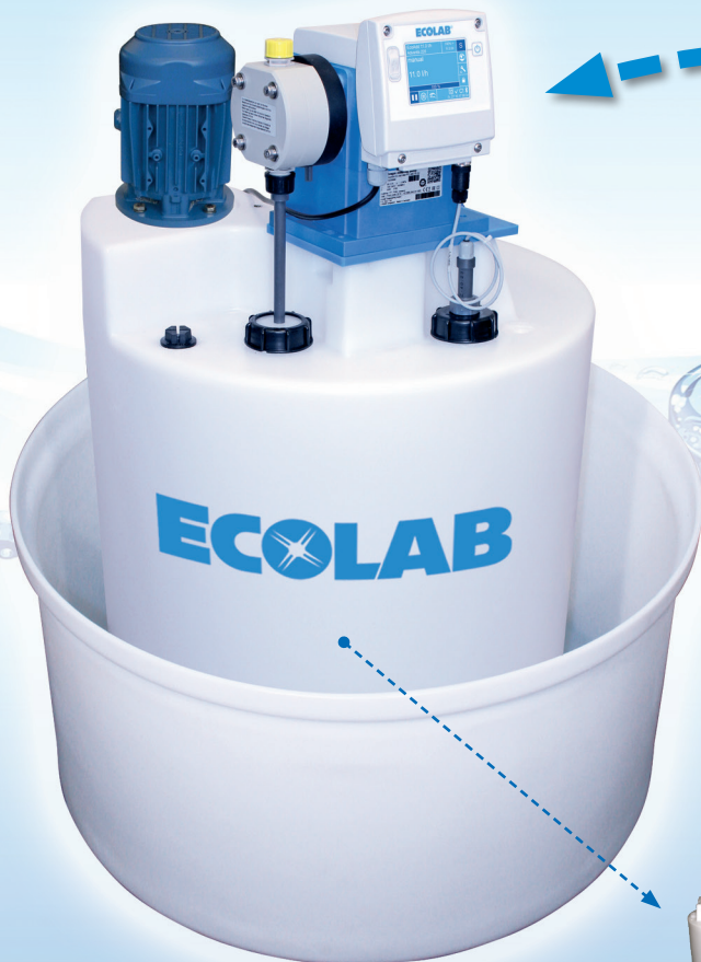
EcoPro from 5 to 120 l/h