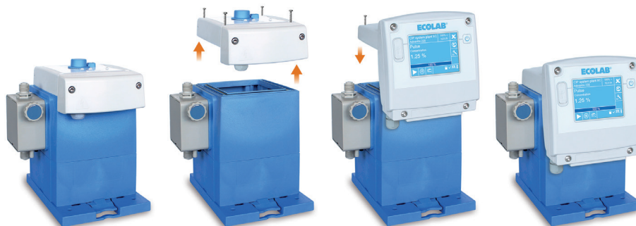
Upgrade of the metering pump from EcoEvo to EcoAdd