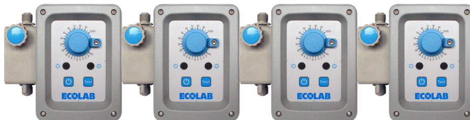
space-saving arrangement in pump racks