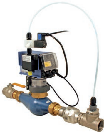
Incimaxx Compact DN 40